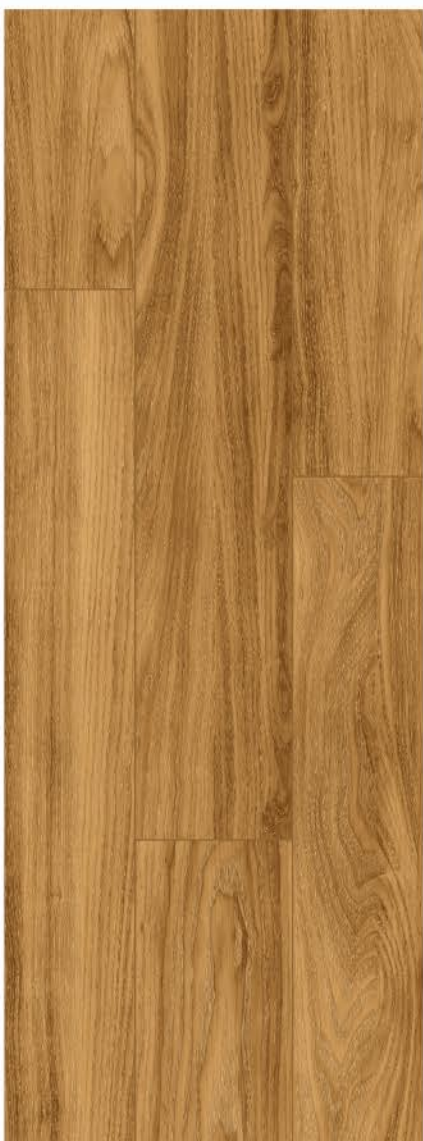
PARKHURST OAK 181x1220mm