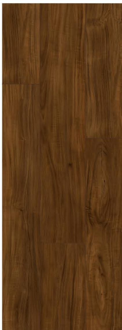
ACACIA DARK 181x1220mm