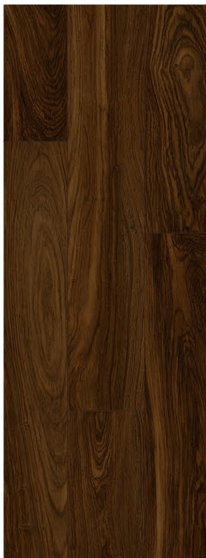
DARK PADAUK 181x1220mm