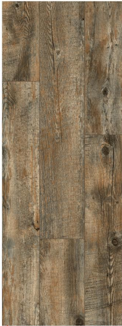
BOSTON NATURAL 181x1220mm