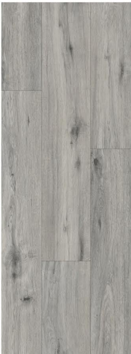
GREY OAK 181x1220mm