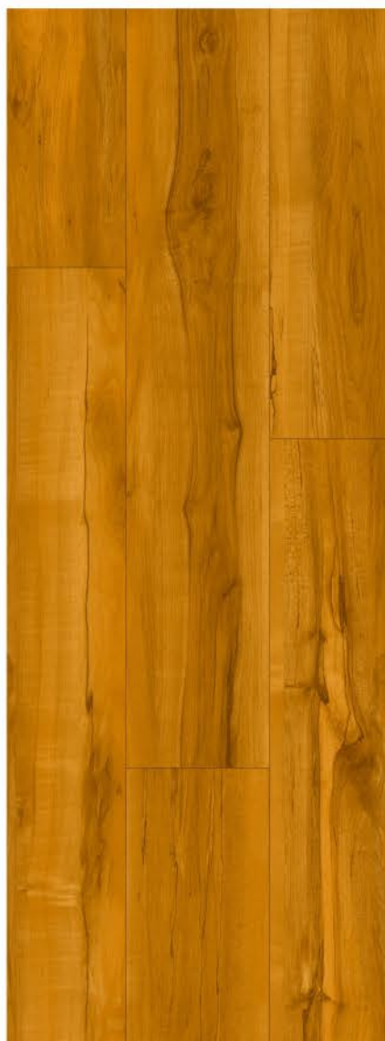
MAPLE BROWN 181x1220mm