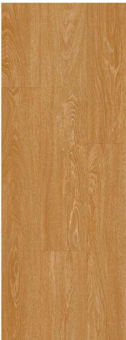
FANCY OAK 181x1220mm