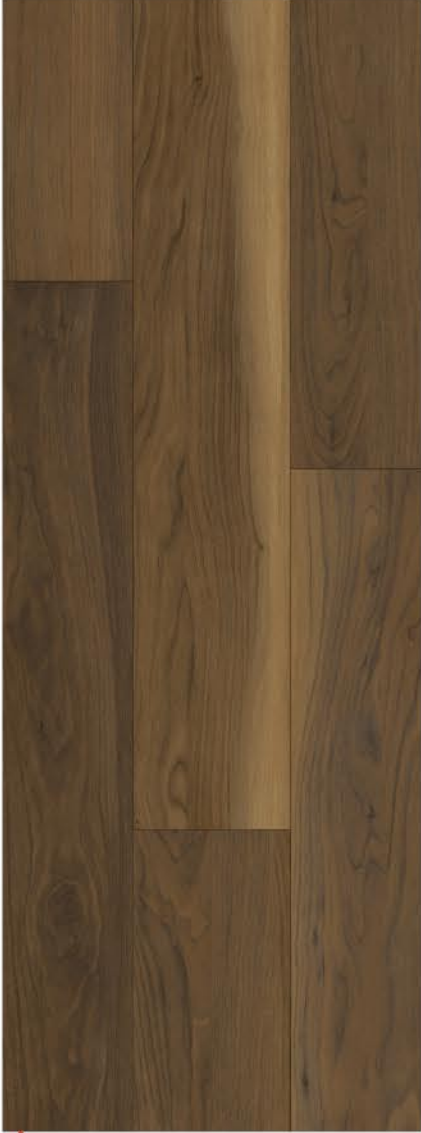
NATURAL WALNUT 181x1220mm