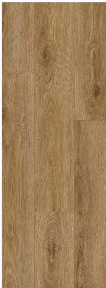
CHARWOOD OAK 181x1220mm