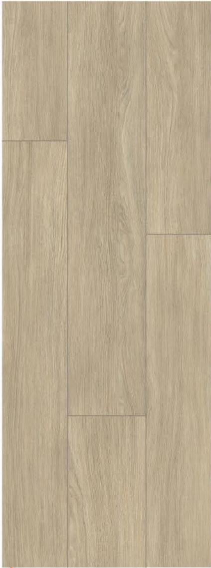
SANDY OAK 181x1220mm