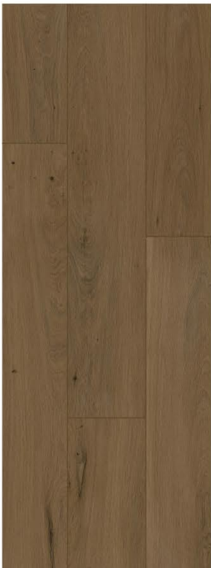
VINTAGE OAK 181x1220mm