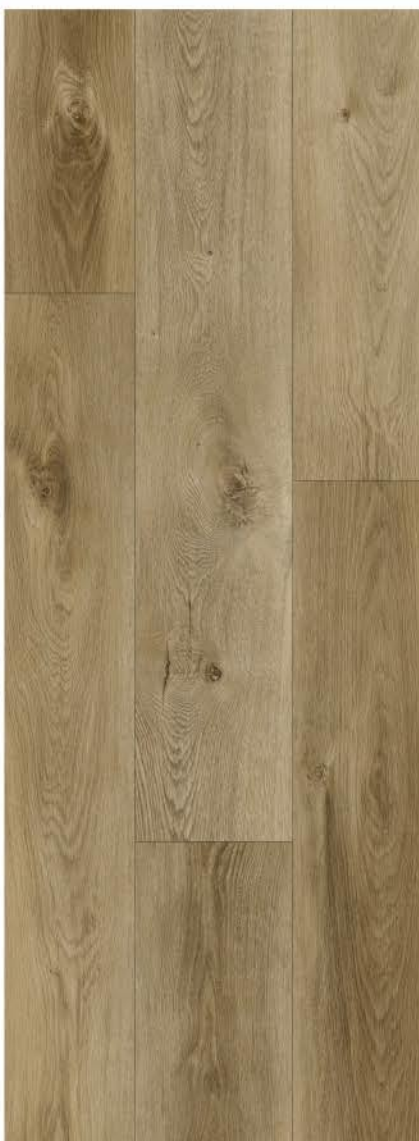
OAK ELEGANT 181x1220mm