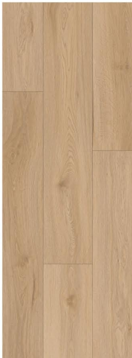
WARM OAK 181x1220mm