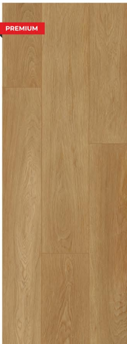
NATURAL OAK 181x1220mm