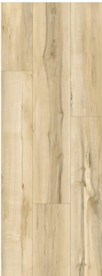
MAPLE BEIGE 181x1220mm