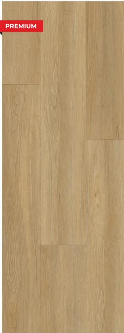
GOLD OAK 181x1220mm