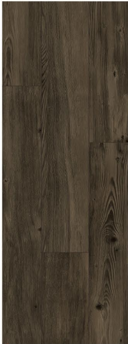
PINE CHARCOAL 181x1220mm