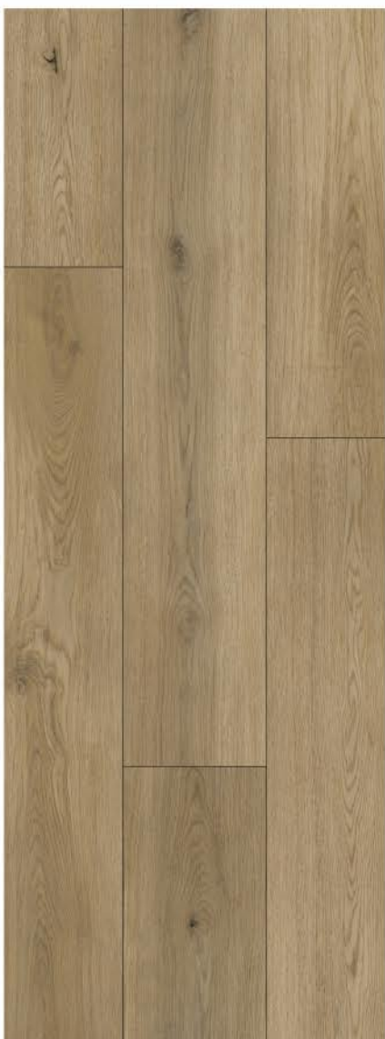
CLASSIC OAK 181x1220mm