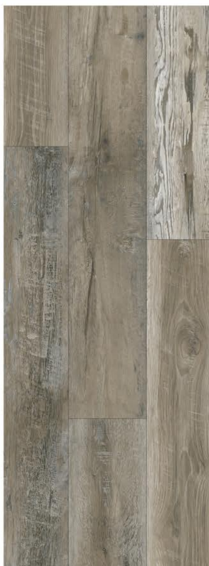
ASH MIX 181x1220mm