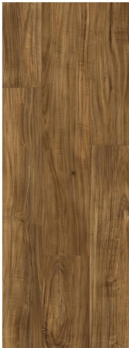
ACACIA BROWN 181x1220mm